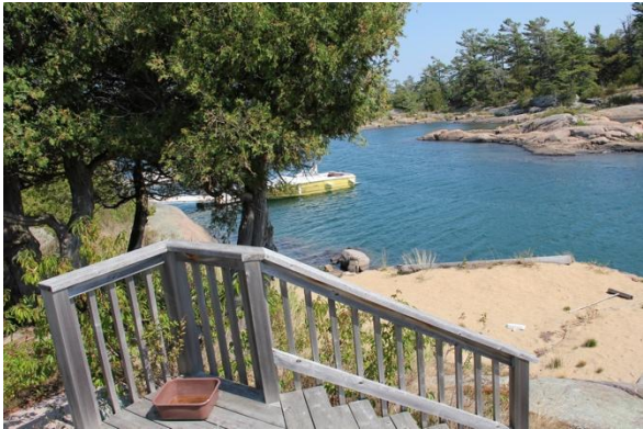
Immediate Access to open water