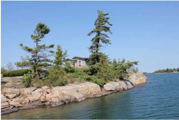
Honeymoon Cabin-approx 16 ft x 15 ft ;en suite 2 pc; swim off rocks