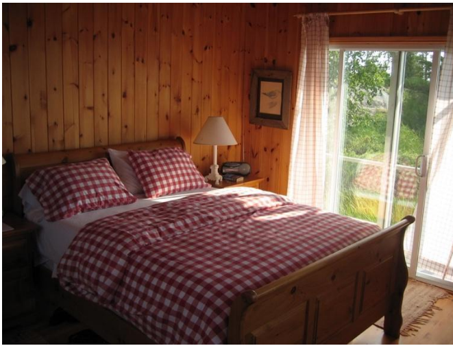
Boathouse cabin- approx. 22ft x 18ft-2 rooms...master and bunk room